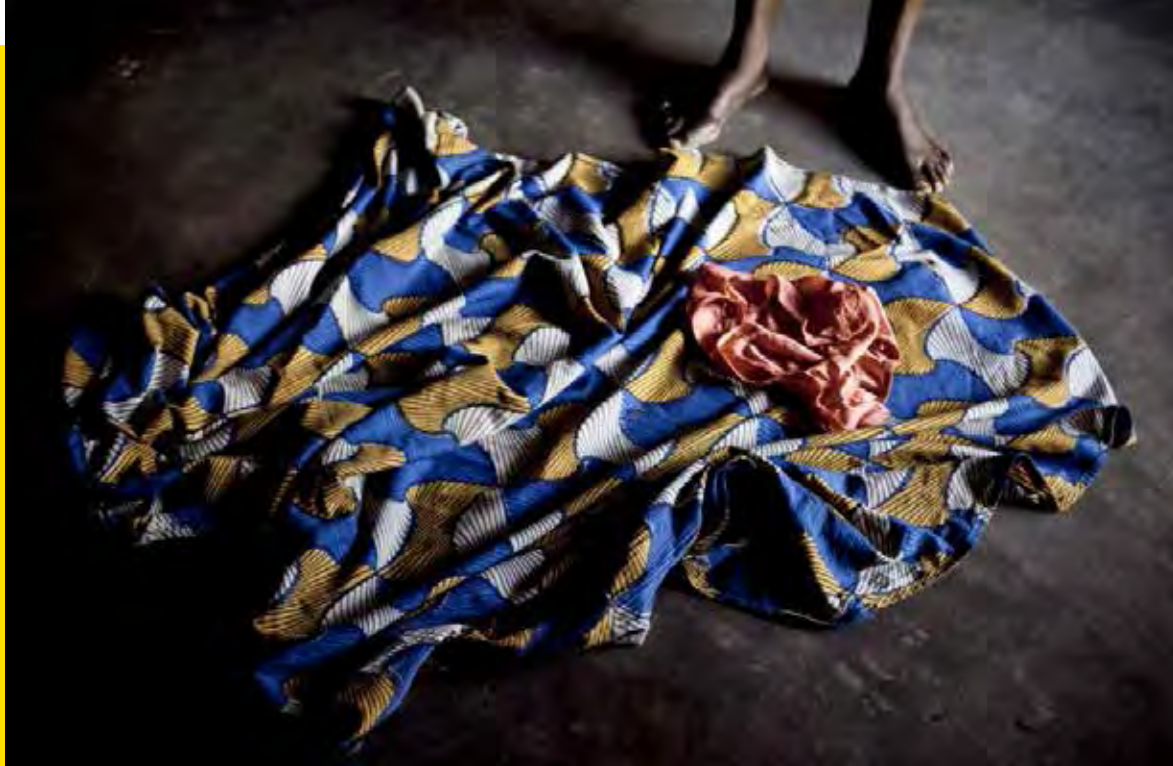
A victim of rape in the Democratic Republic of the Congo.