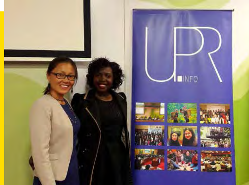
REDRESS supported partners in Uganda engaging with the Universal Periodic Review process in Geneva.

It is particularly important to defend existing standards in the face of an increasingly hostile political environment regarding issues of non-refoulement and even the absolute prohibition on torture. The International Standards programme works in synergy with REDRESS' other programmes. It takes as inspiration the systemic barriers to justice that victims face, which become known through REDRESS' other programmes of work. It also ensures that new standards and related international jurisprudence are reflected in the ongoing work at the domestic level.