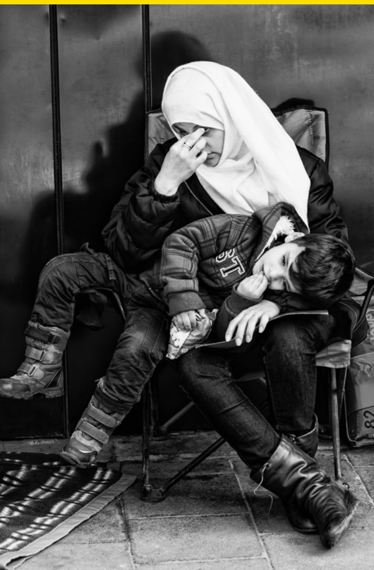
REDRESS called for States to review the inadequate laws and policies towards refugees and other migrants.

REDRESS' international standard setting work consists in carrying out analytical research on the meaning of existing standards, clarifying standards which are vaguely articulated as well as carrying out advocacy to introduce new standards where the existing ones do not adequately address barriers to justice.