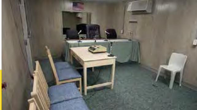
Combatant Status Review Tribunal at Guantanamo Bay.