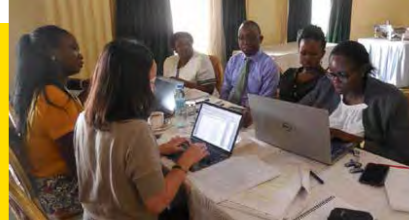
Roundtable with judges and other actors from the International Crimes Division in Uganda.

We provided written input and training to justice actors to help them progress their work on behalf of victims. In Uganda , we provided input to the internal Rules of Procedure of the International Crimes Division , which allow victims to participate in criminal proceedings – a novelty in Uganda. REDRESS has also provided training to the two victims' counsels and has assisted them in the development of a case strategy. We have also provided miscellaneous support to help the counsels to advance their work.