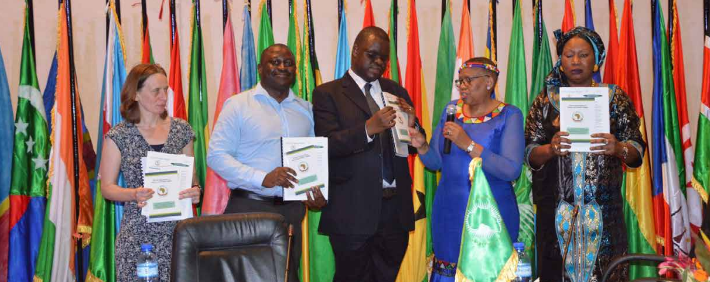
Launch of the General Comment on the Right to redress in Niamey, Niger.

REDRESS has also provided input into the African Commission's efforts to develop guidelines on enforced disappearances .