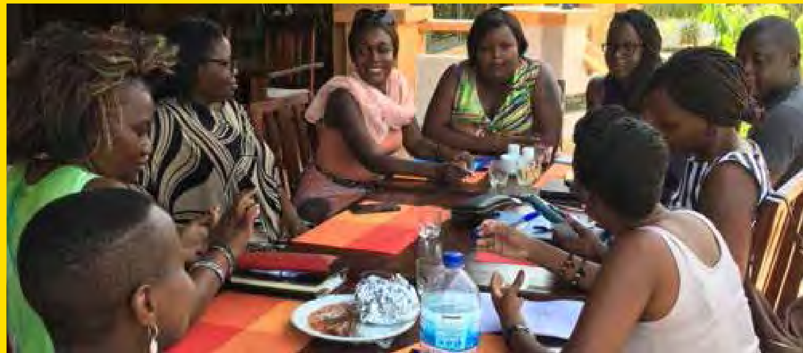
REDRESS supported partners in Uganda engaging with the Universal Periodic Review process in Geneva.

In its recommendations to CEDAW, REDRESS has proposed a number of suggestions which we believe could strengthen the Draft Addendum. These include adding a separate section on redress to emphasise that the right to redress is a distinct right of victims and a legal obligation on States and to provide further clarity to States on the nature and content of their obligation.