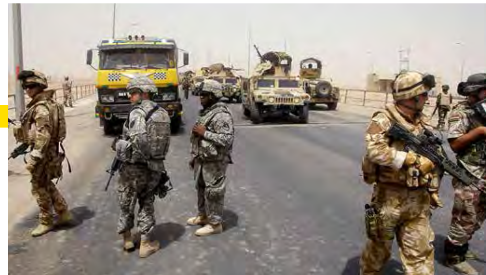
British, US and Iraqi soldiers in Basra, Iraq, in 2008.

It also includes monitoring the performance of the immigration, police and prosecution services as appropriate in detecting persons who are located in the United Kingdom and are alleged to have perpetrated torture or related crimes abroad and ensuring that those persons are duly investigated and prosecuted in accordance with national law and international obligations.