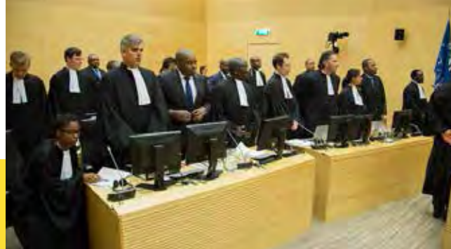
Opening of the trial against Jean Pierre Bemba at the ICC.

Amicus curiae filings are legal briefs that provide analysis to courts to assist them in their decision-making. These submissions are not normally written to support a particular outcome or a party to a case; they are designed to provide the court with specialist information that the court would not otherwise have access to, based on a well-recognised expertise. REDRESS has regularly been granted permission to file briefs in an array of cases falling within its mandate.