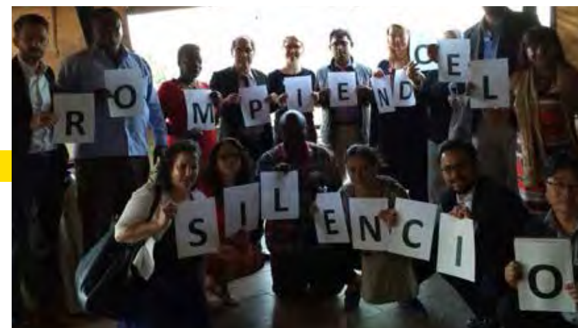
REDRESS and partners during our international conference in Nairobi.

The meeting, which included participants from Argentina, Chile, Croatia, Egypt, Jordan, Kenya, Libya, Mexico, Nepal, Peru, Sudan, Uganda, Zimbabwe was part of a three-year project funded by the EU in which REDRESS and partners from Peru, Kenya, Nepal and Libya looked to develop strategies with partners, lawyers and civil society groups to ensure torture survivors' access to criminal and civil remedies; to advocate for ratification and domestic implementation of international treaties and principles; and to build the capacity of civil society and national actors to enforce anti-torture standards.