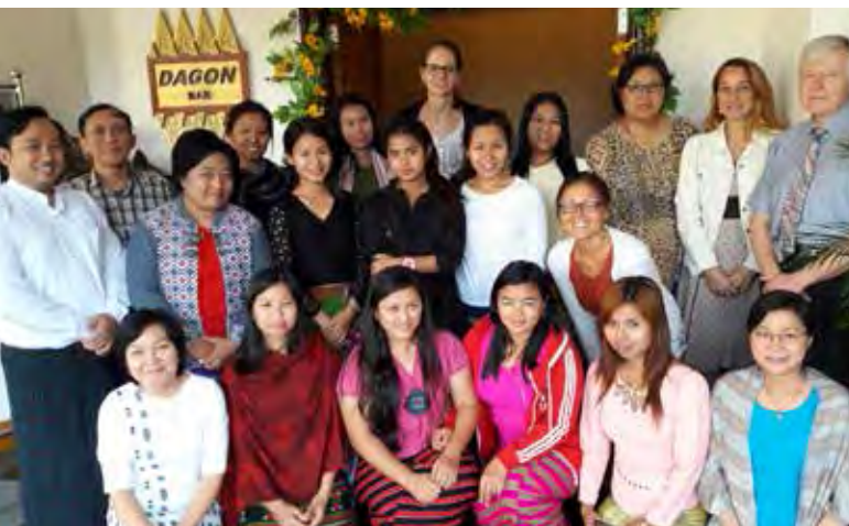
Workshop in Myanmar on documenting sexual and gender-based violence.

support to journalists in the vital role they play in raising awareness about torture, and to "break the silence" for a crime that thrives behind the scenes.