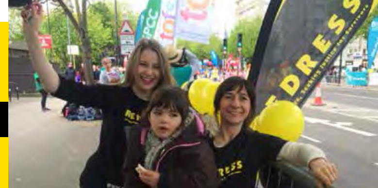
Supporting the REDRESS team at the London Marathon.

UN Voluntary Fund for Victims of Torture