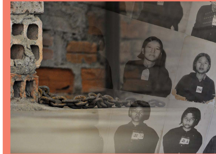
Photos of female prisoners held by the Khmer Rouge at S-21.

The Global Survivors' Fund presented the preliminary findings of two studies on Cambodia and Chad during a side event organised during the 76th Session of the United