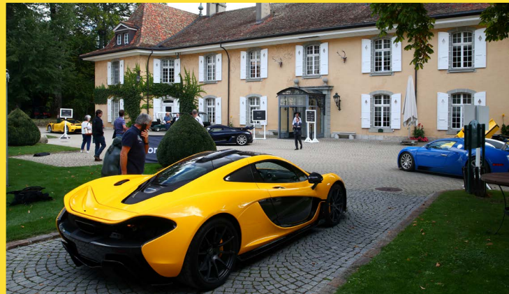
A McLaren P1 Coupe, part of a collection of 25 luxury cars owned by Teodorin Obiang which was confiscated by the Geneva prosecutor's office.

Our organisations have repeatedly called on the UK government to increase its use of Magnitsky sanctions to hold the worst human rights abusers and kleptocrats accountable. Magnitsky sanctions are used across several jurisdictions across the world since 2017 to curb human rights abuses and corruption by freezing the perpetrators' assets and stop them from travelling internationally. They were first introduced by the UK government in 2020.