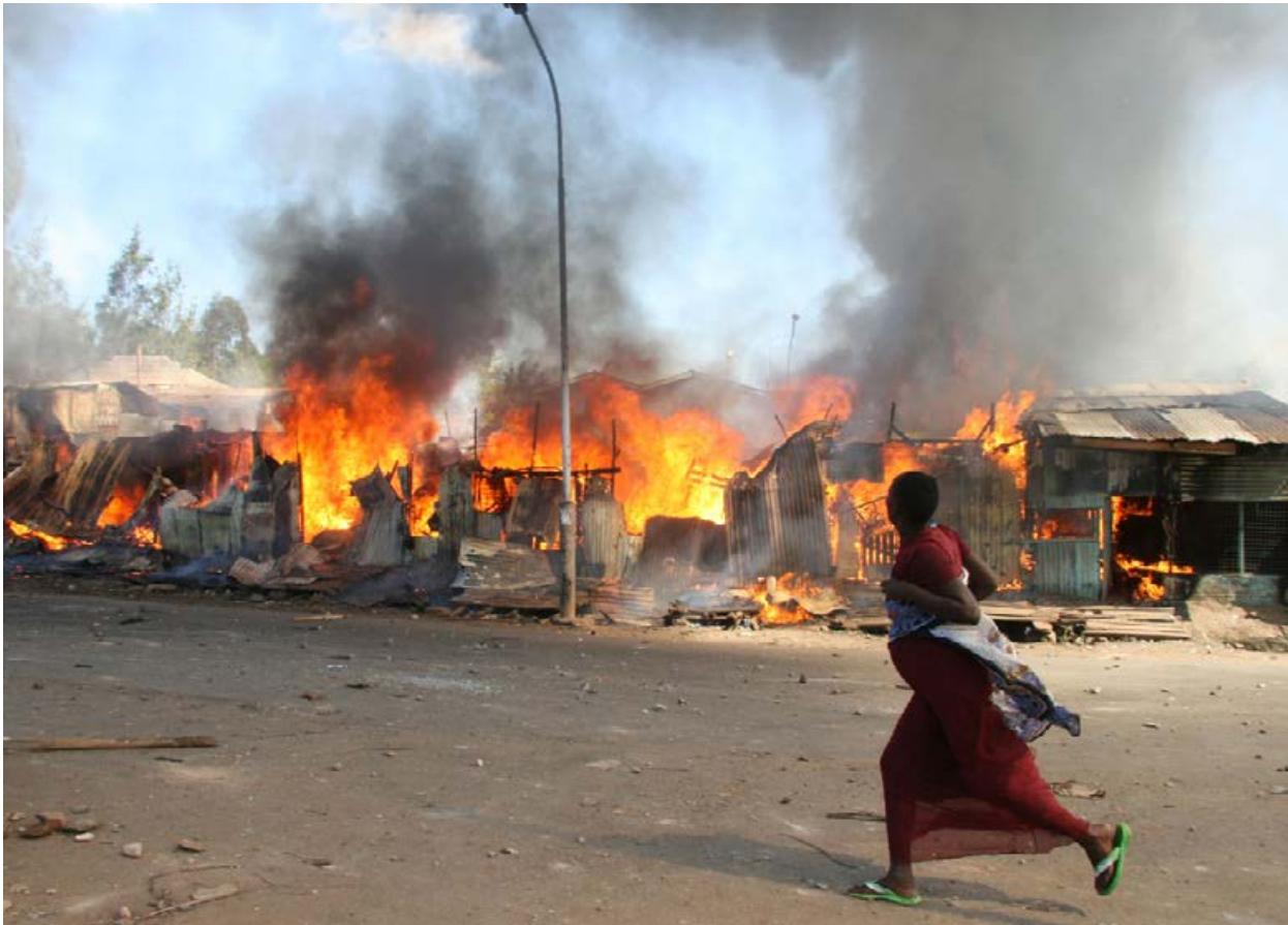
A pregnant woman runs for her safety in Nairobi during the post-election violence.

While reparations come at the end of the litigation process, discussion of the forms of remedies sought should begin as early as possible, as they will impact on an approach to the case and the strategic goals of the case. Under international law, a victim has a right to remedy but the nature of that remedy is at least partly discretionary. The quality of evidence will be important to obtain effective reparations. To correctly assess and identify what remedies should be sought, a holistic victim-centered approach is best, that engages the victim community in the process, together with the use of strong legal arguments and expert evidence.